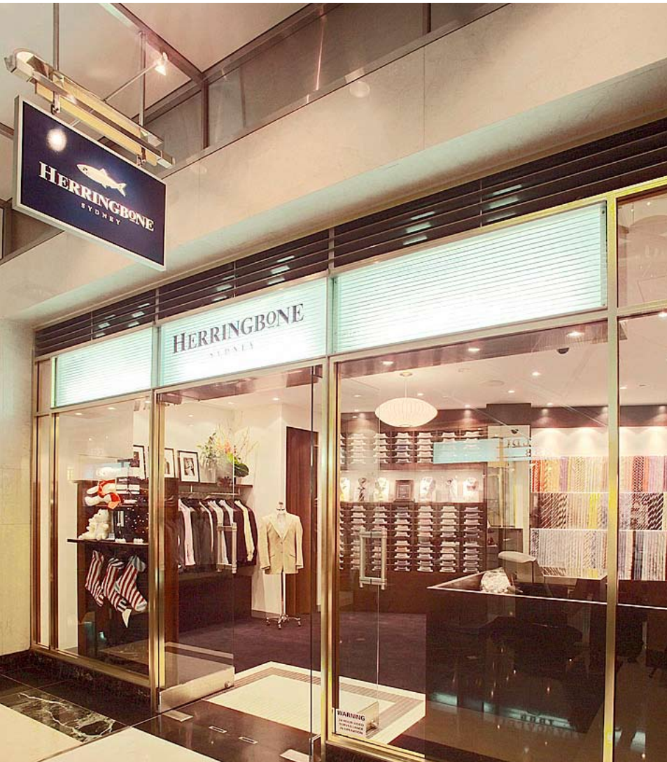
HERRINGBONE CLASSIC CLOTHING